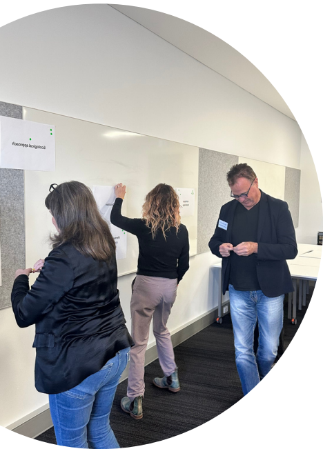
Table groups were asked to discuss and rate priorities with respect to the most important through less important research priority. Following in depth discussions, debate, and sharing of lived experiences, the final list of priorities was determined using a dotmocracy process whereby consumers ranked the final 9 key themes into the following research priorities for Institute.